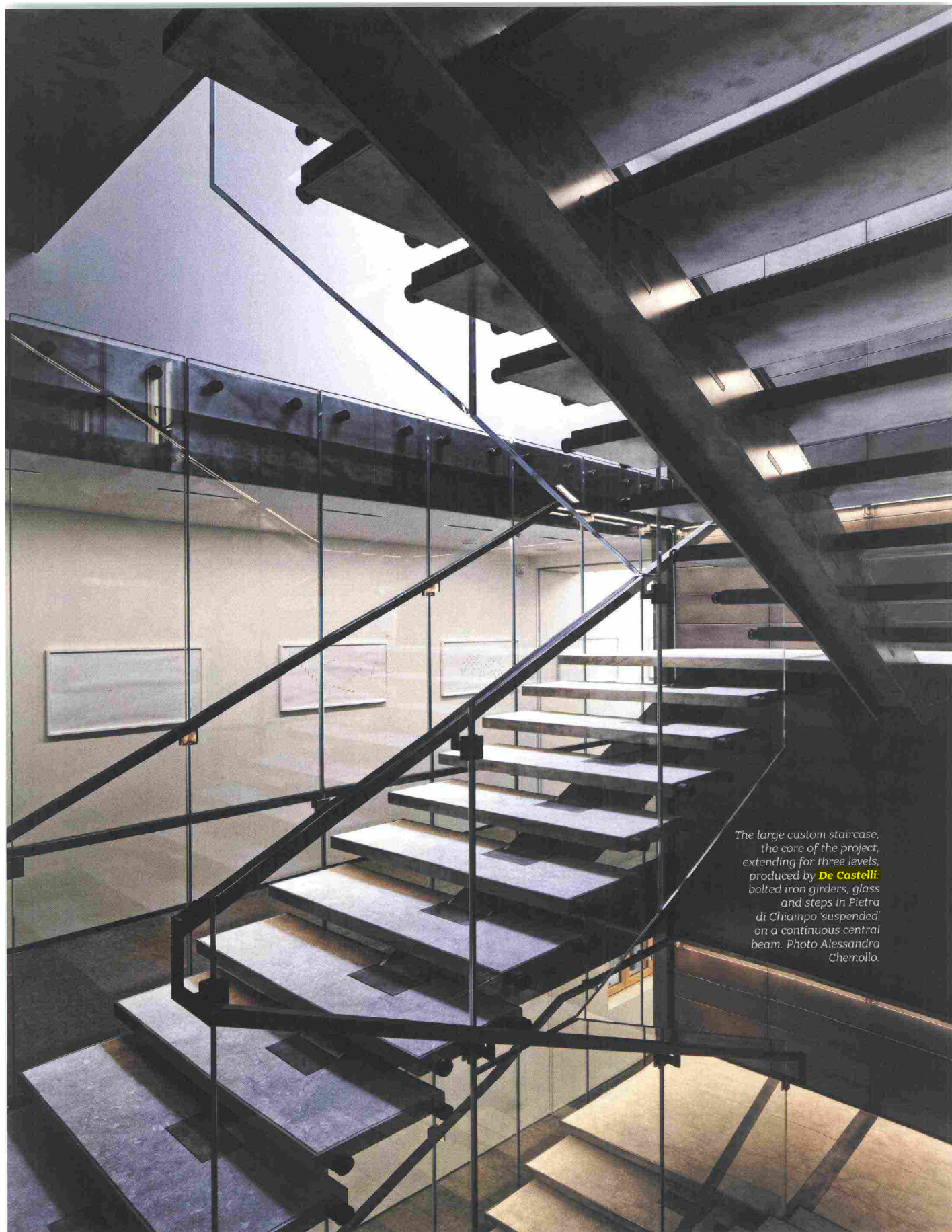
The large custom staircase, the core of the project, extending for three levels, produced by De Castelli : bolted iron girders, glass and steps in Pietra di Chiampo 'suspended' on a continuous central beam.